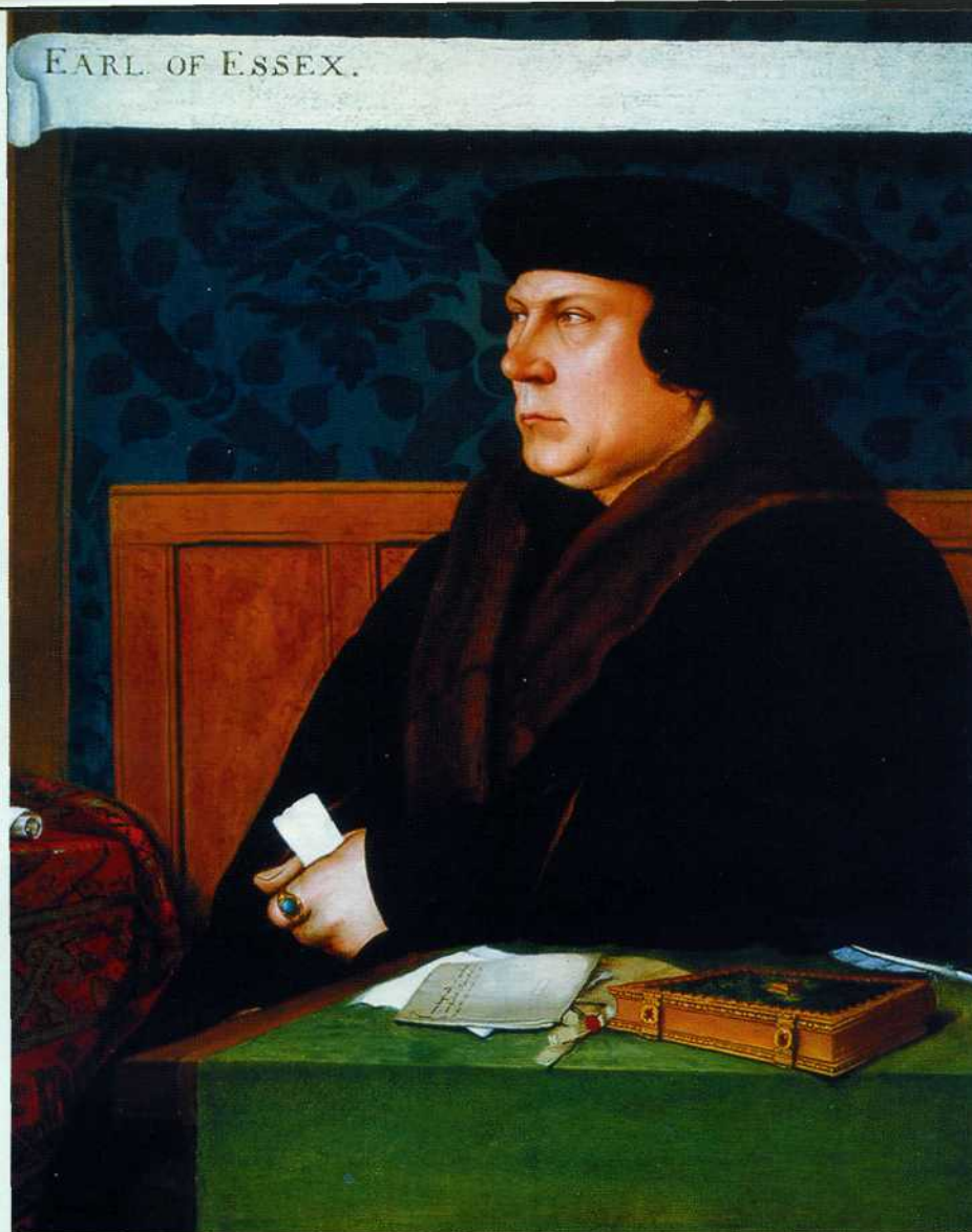
Thomas Cromwell (c.1485-1540), who was considered by Robert Aske and other Pilgrims to be an evil low-born counsellor leading his monarch astray. Was Cromwell's fall hastened by the Pilgrimage of Grace?

The size and quality of the force meant that they could challenge the crown in battle, but as we suggested this was not their aim. They wanted to negotiate, but to support this with the